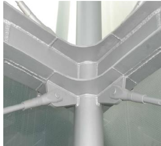
PARTICOLARE "1" INTERVENTO "TIPO V1"